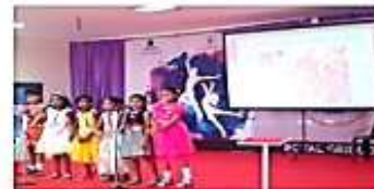
Action Song on Habitat