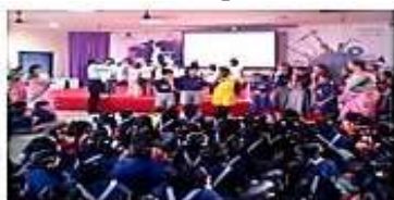
Introduction of kids cabinet

The power point presentation was done by class V. The presentation included the different habitat of animals, their adaptations, and their interdependence. This was followed by a short film on habitat.