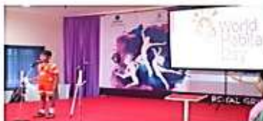
Speech on Habitat