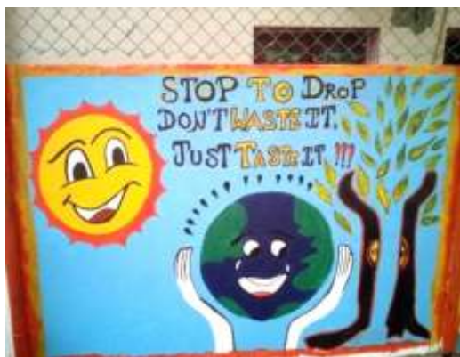
Young budding Artist

Date : 02-02-2016 Time: 3.30 to 4.30 P.M