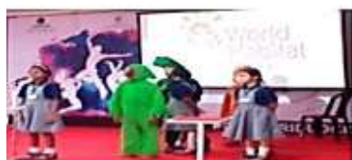
Image and messages