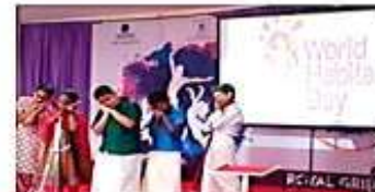
Skit - Habitat