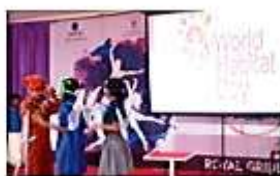
Skit - Habitat