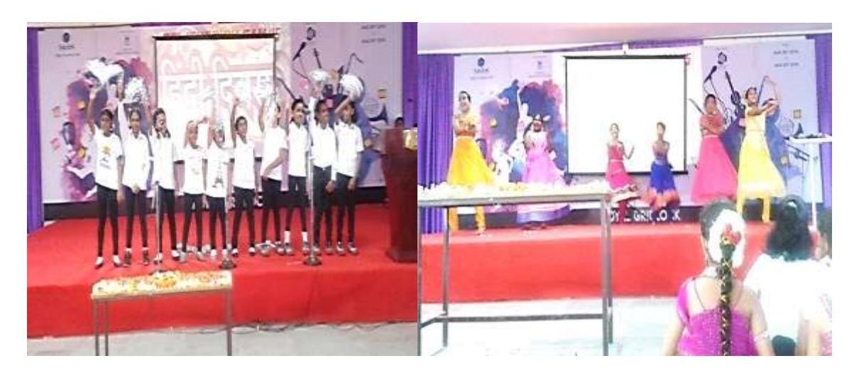
Indian cultural dance performed by Students of class IV& V.

Date : 04-09-2015 Time: 9.00 AM to 10.30 PM