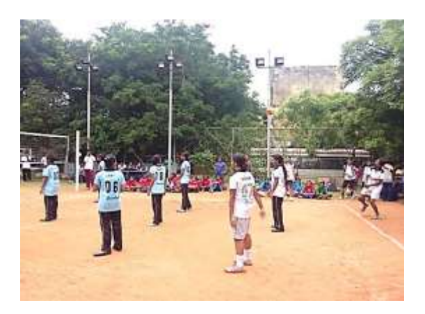
The following events were conducted for Girls in track and field events: Throw Ball,Kho – Kho,VolleyBall,Foot Ball Track & Field events