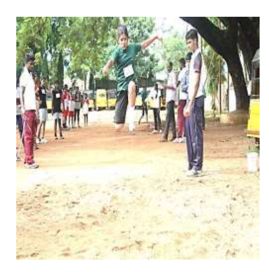
TRACK EVENTS FOR BOYS