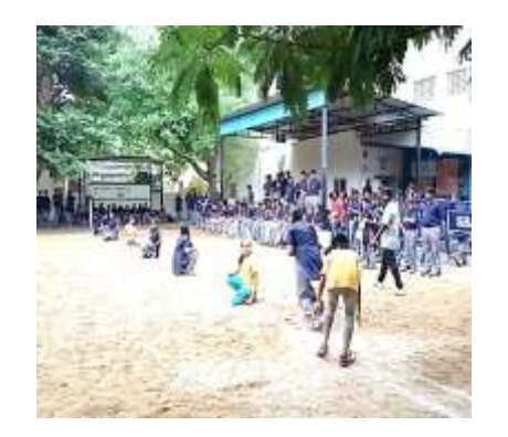
INTRAMURAL- THROW BALL - GIRLS