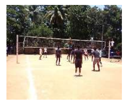
INTRAMURAL - VOLLEY BALL - BOYS