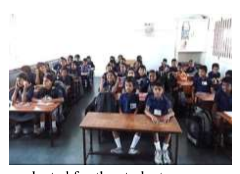
conducted for the students.

Resource\ Person \quad : \quad English\ Language\ Club\ members